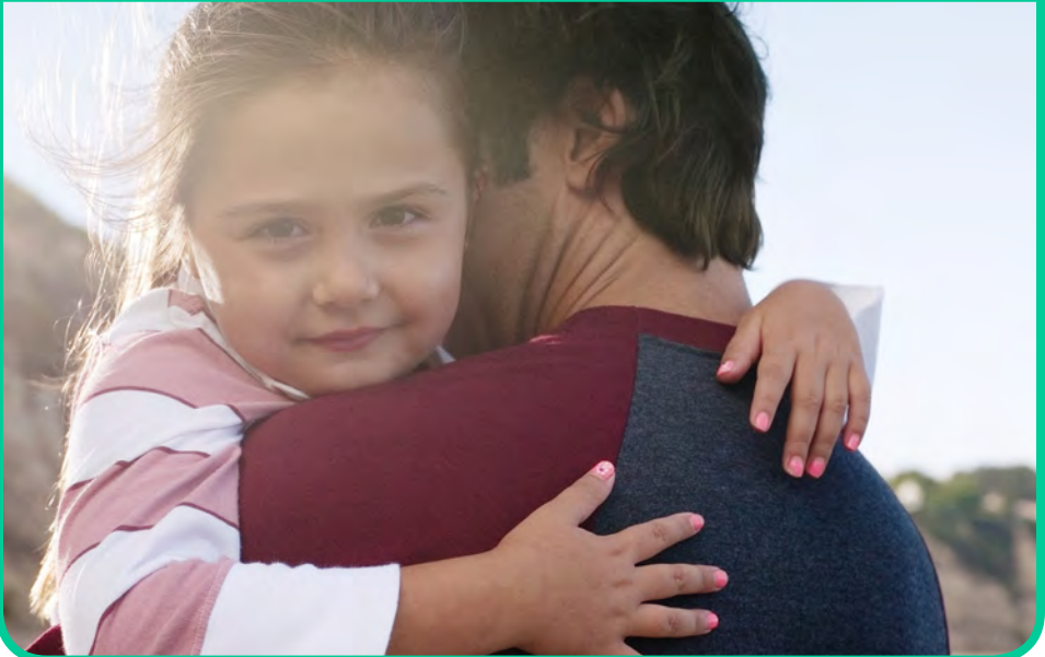
Image Credit sb10068249s-001, Siri Stafford, DigitalVision, Getty Images

When you feel calm , you do not feel worried, scared, or angry.